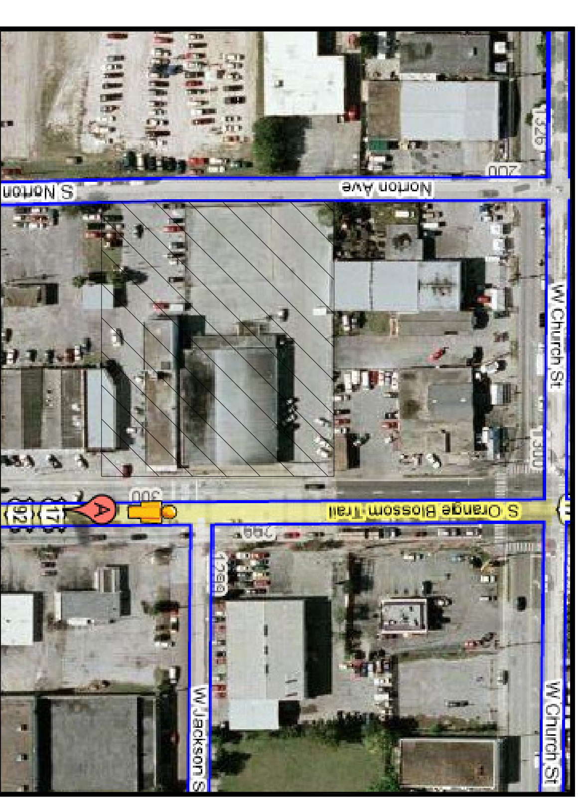
AERIAL PHOTOGRAPH 1" = 100' GOOGLE MAPS (HTTP://MAPS.GOOGLE.COM/) MAP DATA 2008